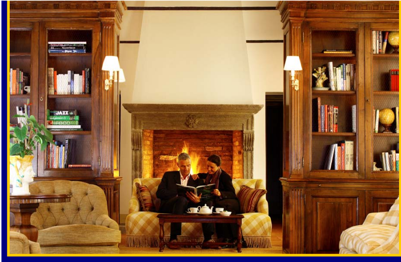
Reading Room at Castello Banfi - il Borgo