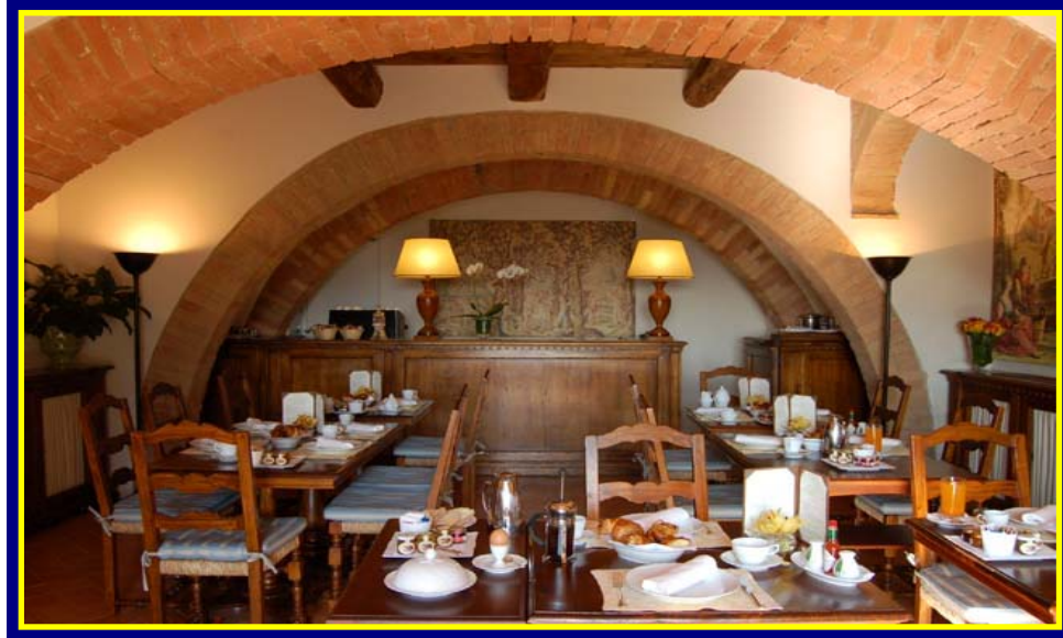
Breakfast Room at Castello Banfi - il Borgo