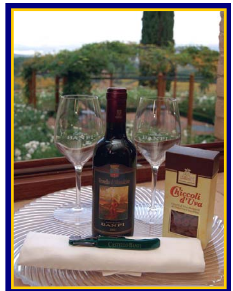
Brunello di Montalcino & Chiccoli d’Uva