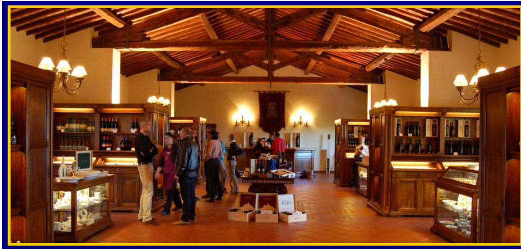
Enoteca at Castello Banfi